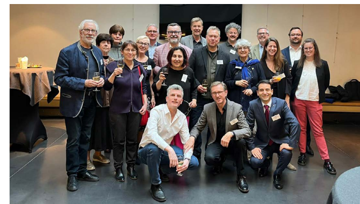
75th Anniversary's General Assembly in Brussels in 2022

An important prerequisite for aeaa membership is the recognition of the Code of Practice as the ethical basis for all professional activities. This was developed together with IAMA as a seal of quality for the members of both institutions.